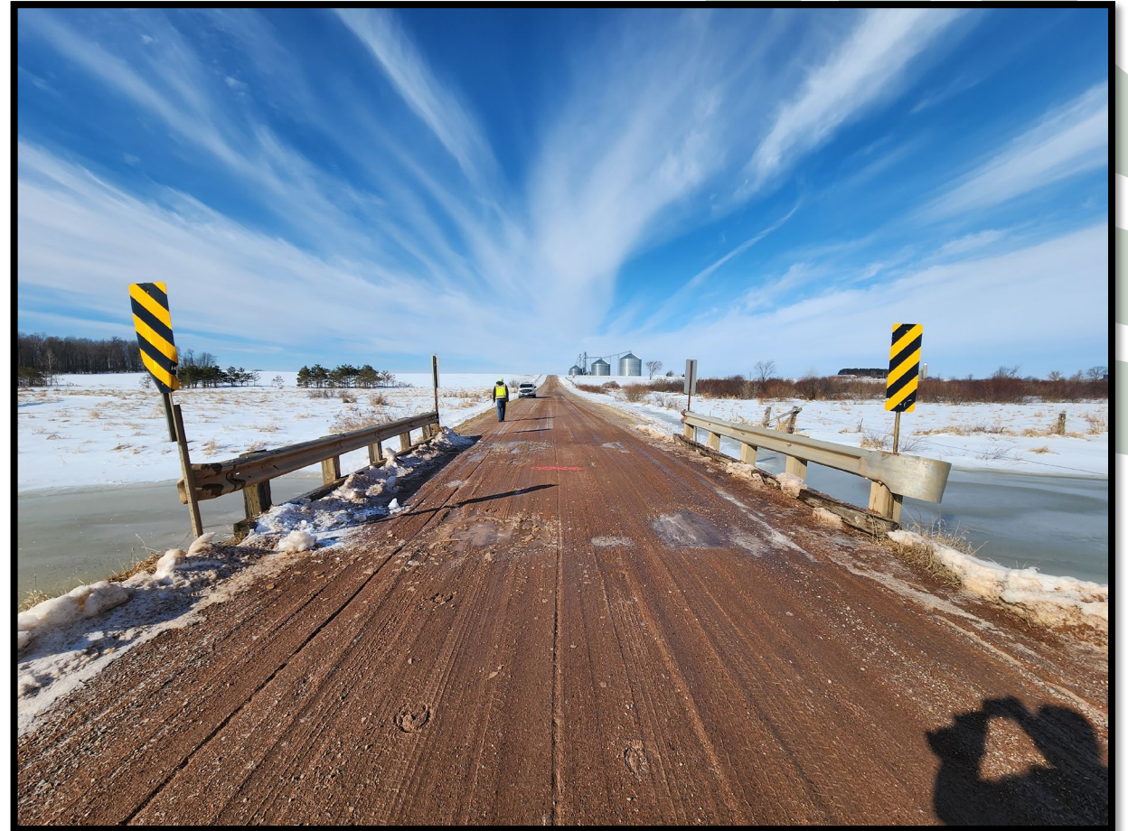
View of the current North Branch Oneill Creek Bridge, looking west.